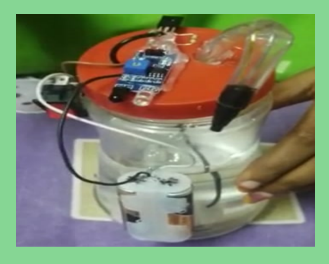
Low Cost Smart Contactless hand Sanatizer dispenser.

Total 21 project taken pitch start and TWO have been completed.