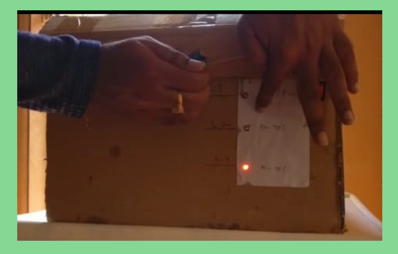
Solar based Smart Contactless hand Sanatizer dispenser.